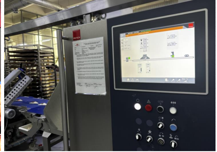
TALKH CHIKHER JSC 2022 ANNUAL OPERATION REPORT