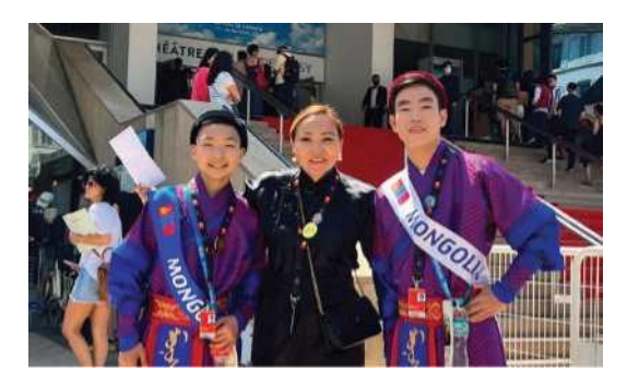
The company sponsored the children's movie, which participated in the Cannes Film Festival for the first time from Mongolia.

The Cannes Film Festival, the world's premier film festival, is being organized for the 75th consecutive year this year. At the Film Festival, artists of the film "Adventures of the Big Head" participated in the film festival for the first time from Mongolia in the Marche du Film commercial section as a children's film, sponsored by Monos Foods JSC.