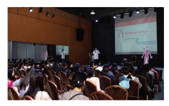
"Let's take care of our hearts" Day

The Cannes Film Festival, the world's premier film festival, is being organized for the 75th consecutive year this year. At the Film Festival, artists of the film "Adventures of the Big Head" participated in the film festival for the first time from Mongolia in the Marche du Film commercial section as a children's film, sponsored by Monos Foods JSC.